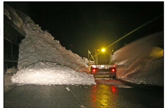
Removing avalanche at existing snowsheds