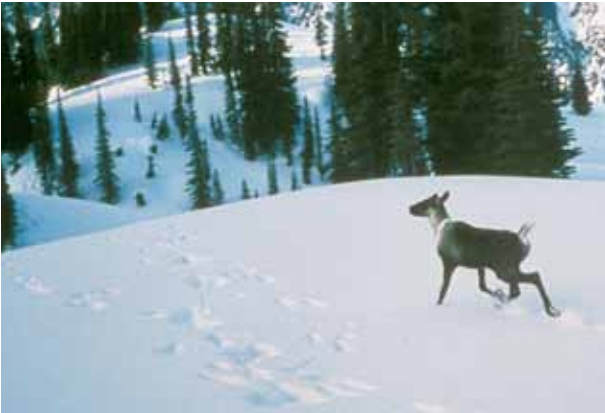
Mountain caribou assured some peace and quiet.