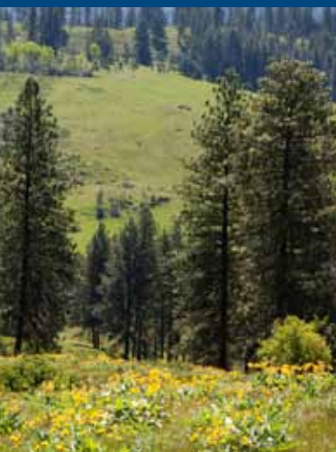
Bar Colville in Ferry Co.