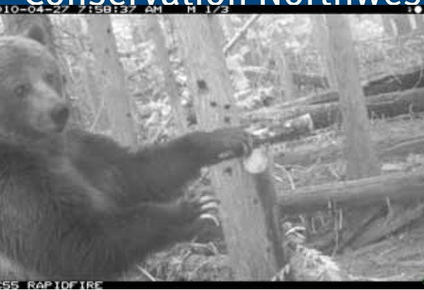
Grizzly bear just north of Washington's North Cascades on remote camera.

BC in the North Cascades. Scientists have also documented grizzly bears in the Clear Range east the Fraser River.