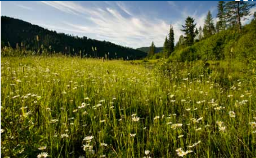
Quartzite Roadless Area, south of Spokane, proposed for wilderness protection.

and private lands to collaboratively accomplish wilderness protection, restoration, and sustained working lands.