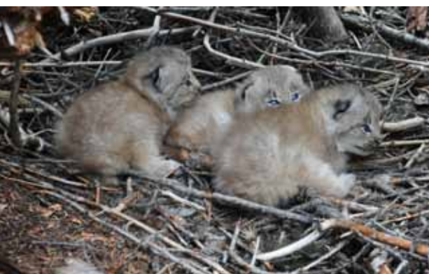
Lynx kits born this year on the Loomis.

Our Columbia Highlands Initiative helps connect lynx habitat between the Cascades and Rockies, important for a species that faces threats including loss of habitat from climate change.