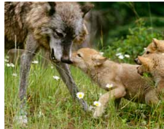
Wolves are highly social.

Since 2008, when a groundbreaking BC mountain caribou recovery plan spelled some relief for key parts of the Inland Temperate Rainforest, we've worked to protect areas in the recovery lands important to caribou in winter.