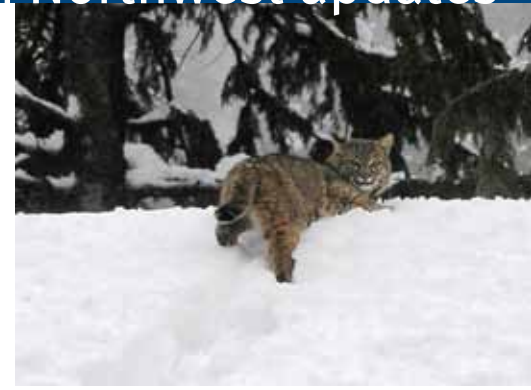
A bobcat makes its way up the I-90 embankment.

a faulty northern spotted owl recovery plan to provide better protection for owls and Northwest old-growth habitat. Our next step is to make sure the revised owl recovery plan is scientifically rigorous and will restore this icon of old forests.