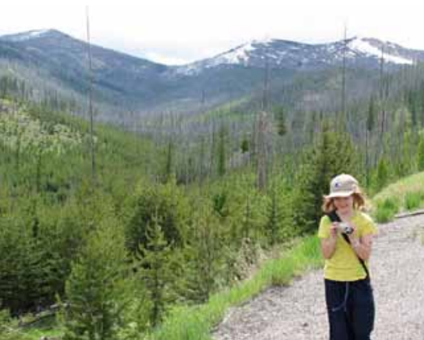
Wilderness: what it's all about.