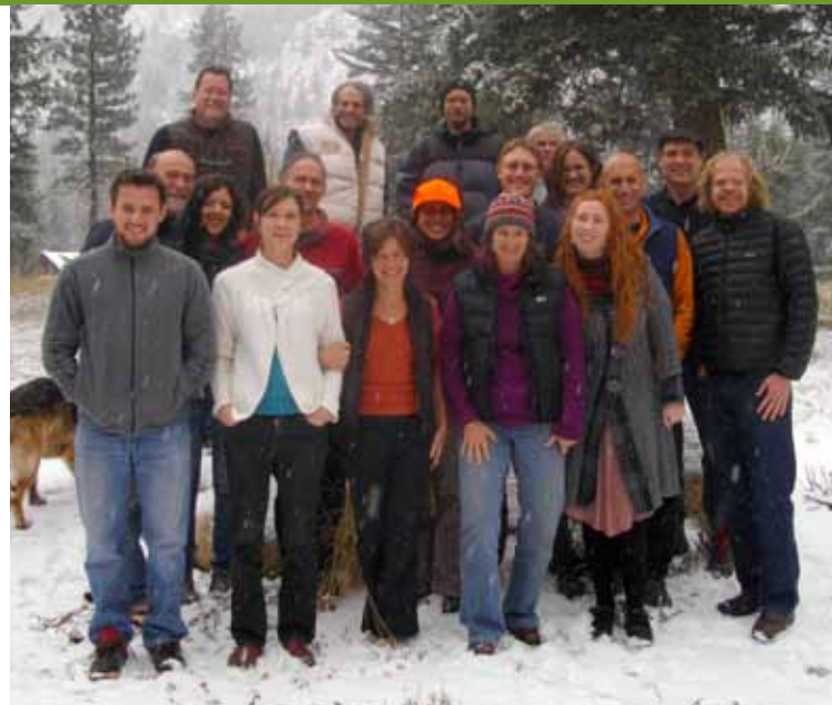
Conservation Northwest staff, 2010.

In the Columbia Highlands we have science-based and climate-smart landscape-scale conservation on public and private lands. Collaboratively, we are accomplishing wilderness protection, restoration, and sustained working lands, all with substantial public buy-in. Thank you for taking us there.