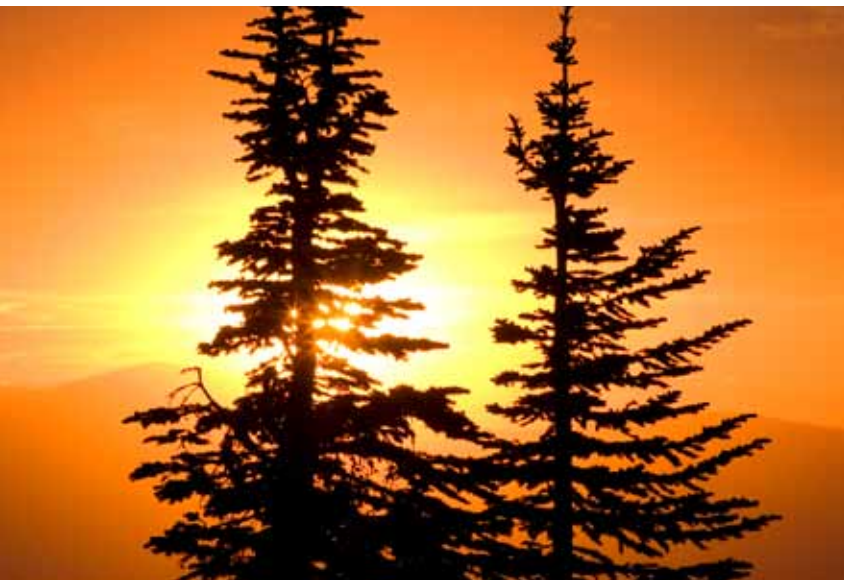
Sunrise, Columbia Highlands.