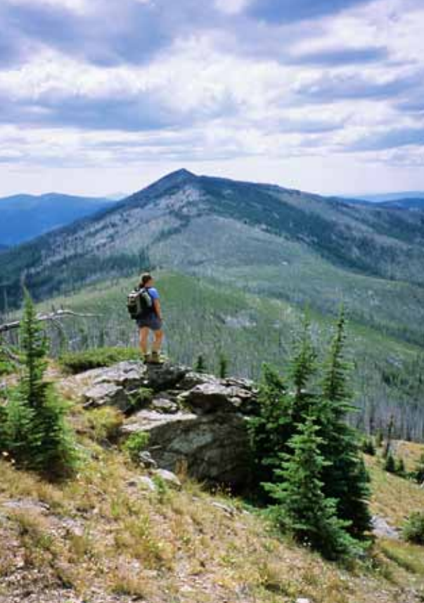
Along the Kettle Crest.

“Providing for climate adaptation is what we at Conservation Northwest do best. We are already building in room for plants and animals to adapt, building resilience into natural systems, and providing safe harbor by connected wildlands, such as in the Columbia Highlands.”