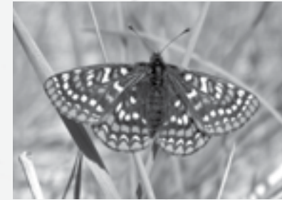
Taylor's checkerspot butterfly on the oak-woodland prairie.

Conservation Northwest and partners have long fought to keep this remarkable piece of prairie safe for endangered and at-risk wildlife that find a home there, including streaked horned lark, Mazama pocket gopher, western gray squirrel, water howelia, and mardon skipper and Taylor's checkerspot butterflies. Oregon spotted frogs, another endangered species, were recently reintroduced to the area.