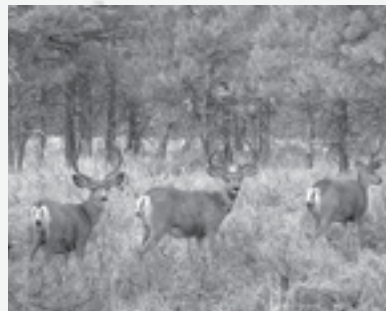
New powerline would harm mule deer.

Citing concerns about costs to the state for managing the sprawling network of new roads and increased risks of invasive species and wildfire, Commissioner Goldmark wants to continue to