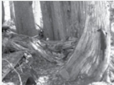
Fisher family on the peninsula.

Photos recently confirmed that fishers reintroduced to the Olympic peninsula were successfully breeding. In early September, a mother and kits were photographed near a den site. Conservation Northwest initiated the recovery effort several years ago after conceiving the idea and funding a feasibility study that was conducted by Washington Department of Fish and Wildlife. We were later joined by Olympic National Park, who conducted the environmental analysis, and US Geological Survey, who contributed to the research and monitoring activities.