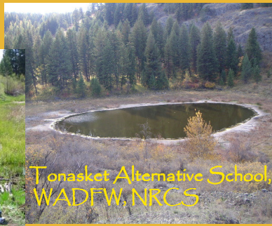
Tonasket Alternative School, WADFW, NRCS