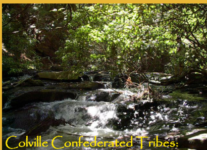
Colville Confederated Tribes: