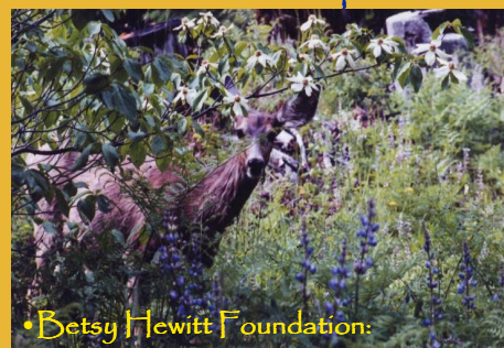
• Betsy Hewitt Foundation: